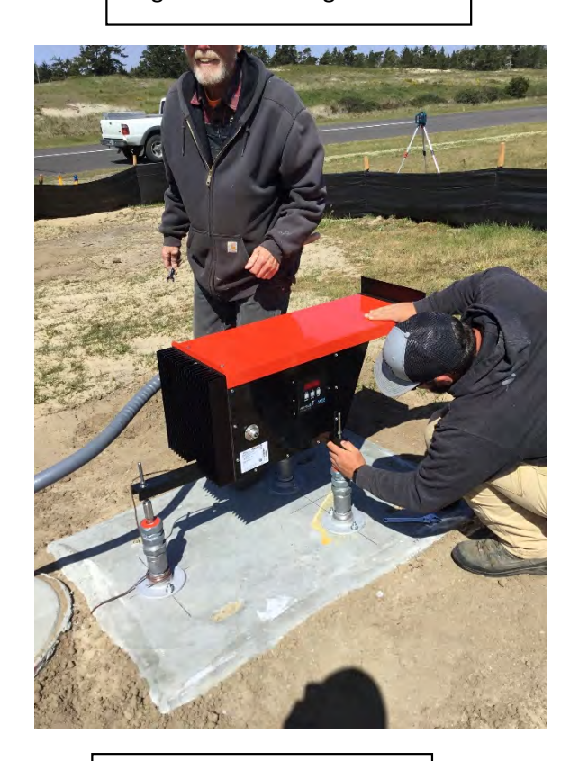
Runway 15 PAPI Installation