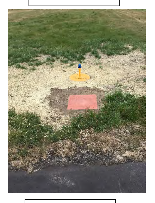
Duct Bank Marker