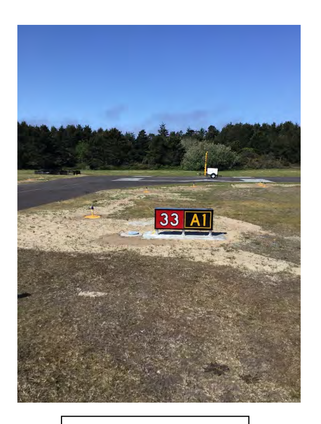
Guidance Sign Installation