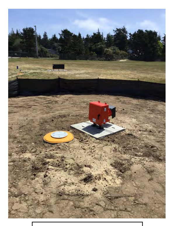
Runway 33 REIL Unit