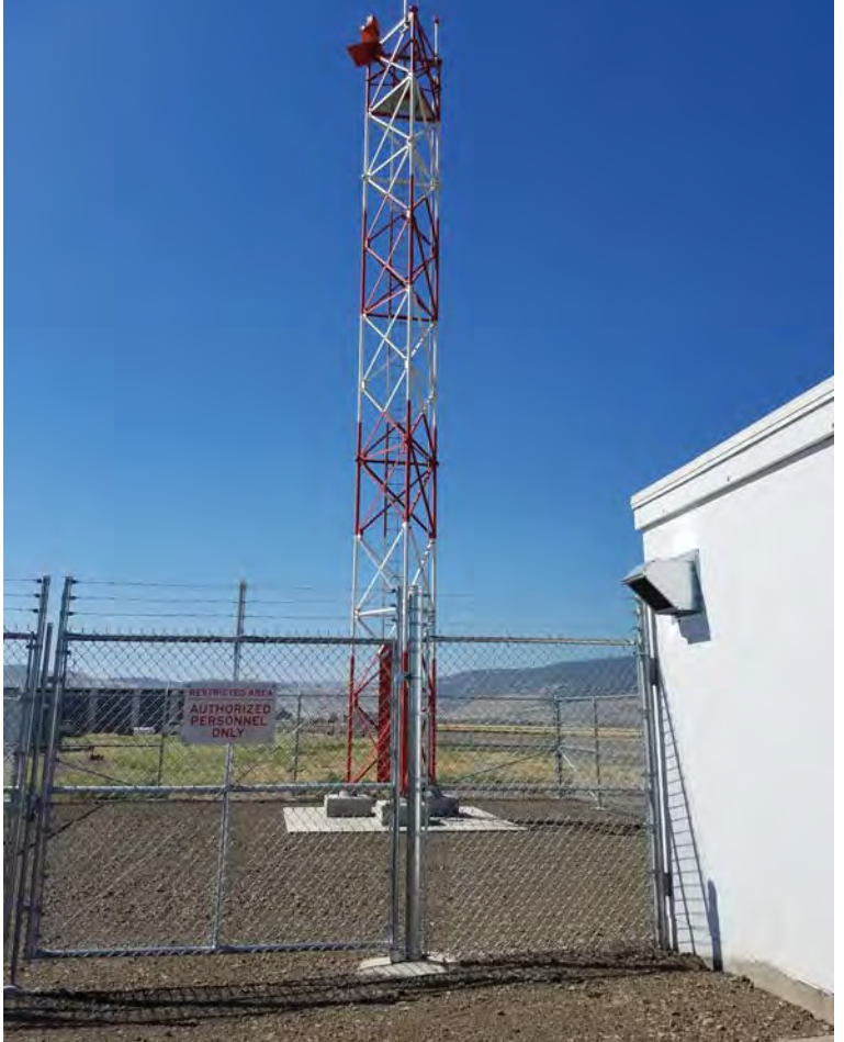
Left: La Grande Airport Beacon

Below: Lexington Airport apron reconstruction.