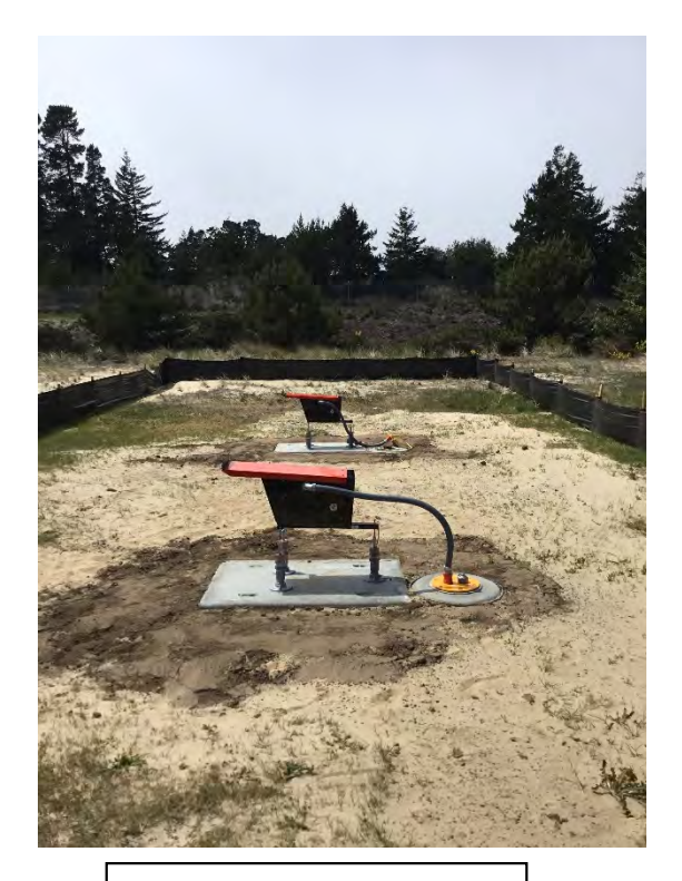
Runway 33 PAPI