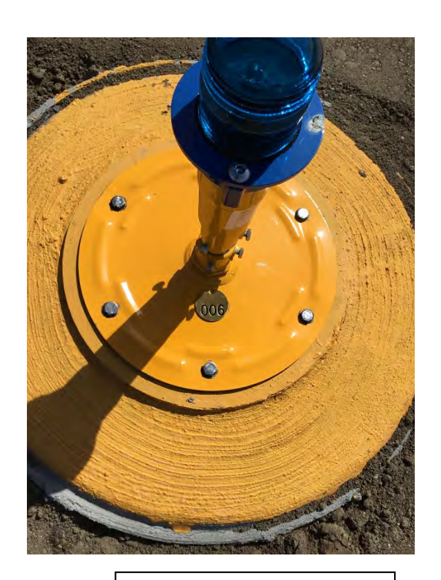
Light Identifier Tags Installed