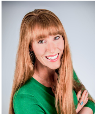
the Oregon Board of Dentistry.

With the leaves changing vibrant colors and a chill in the air, autumn is moving into full swing. With the season change, I recognize what a natural time it is for us to pause and reflect on 2019. Every year has its ups and down with different challenges and joys. What stands out about 2019 for you? As I recall 2019, I focus on gratitude. I have gratitude as I think about my personal life, the profession of dentistry in Oregon, and for the role of