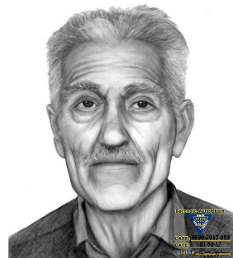
Age Progression Drawing