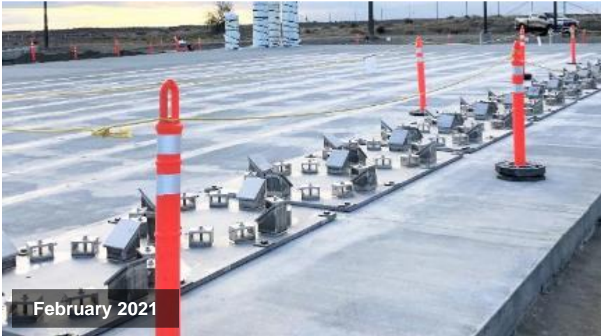
Tank-Side Cesium Removal System