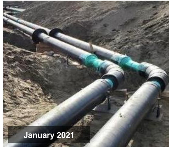
Transfer Line Progress