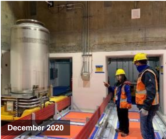
LAW Bogie Testing