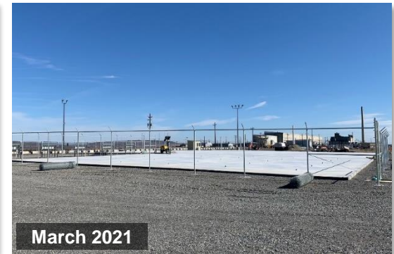
Capsule dry-storage pad