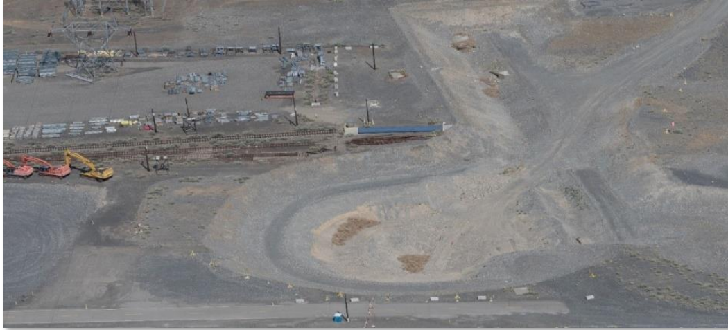
K Reactor Area waste site 2021