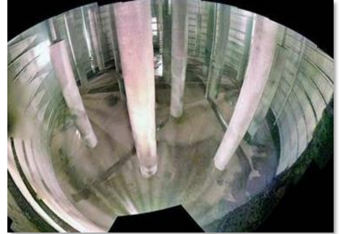
Tank AX-102, post-retrieval