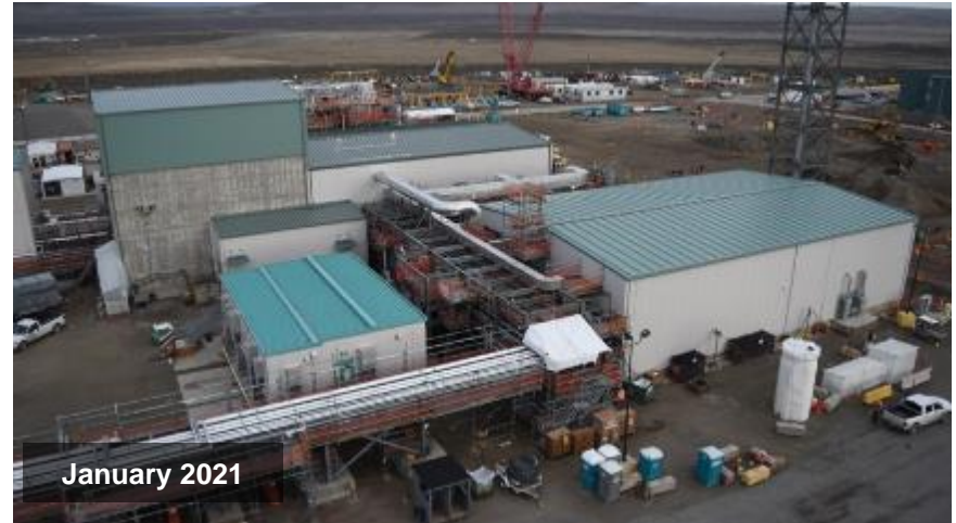
EMF Construction Complete