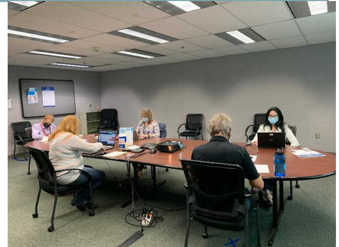
DOE Virtual Public Comment Period Meetings

*Use the Chrome web browser to access the virtual tours website.