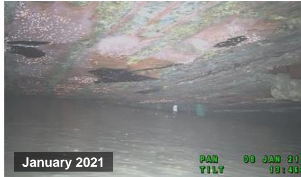
Z-9 interim stabilization - AFTER