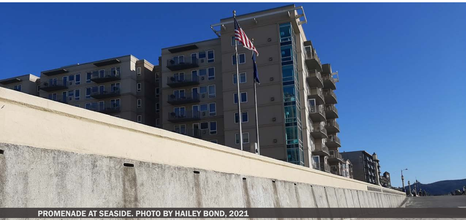
PROMENADE AT SEASIDE.

Seawalls are a common sight along the central Oregon coast (e.g. Gleneden Beach), especially in populous areas. Riprap revetments are generally preferred over seawalls currently, but many seawalls in good repair are visible all over the coast.