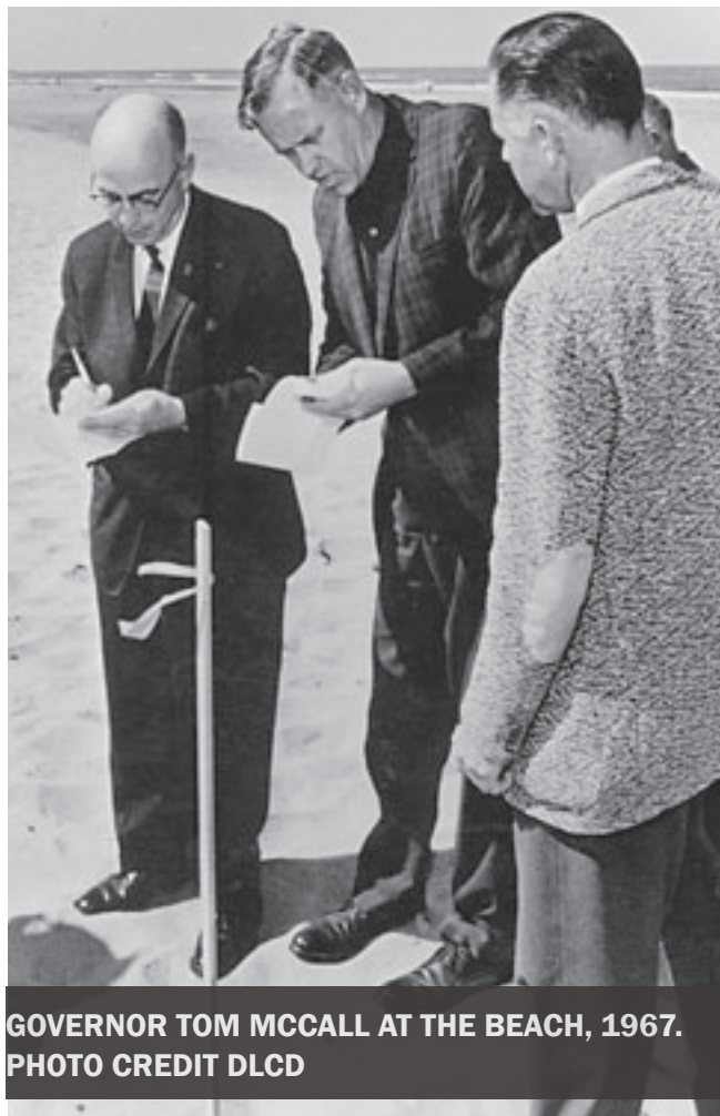
GOVERNOR TOM MCCALL AT THE BEACH, 1967.

The 1967 Beach Bill was a landmark piece of legislation that captured the attitude of Oregonians towards the idea of a public right to the beach. The bill has its roots in the designation of the public beach as a highway by Governor Oswald West in 1913. The public assumed that this designation gave them rights to the entire beach. However, challenges by private property owners in 1966 clarified that the beaches were only public below the ordinary high tide line and that 112 of the 262 miles of sandy beach were privately owned. This led to a high-profile fight in the Oregon Legislature to pass the Beach Bill in 1967, which “codified into law already existing public rights to dry sand beaches” and “gave the State Highway Commission the authority to police, protect, and maintain the property.” (Straton, 1977)