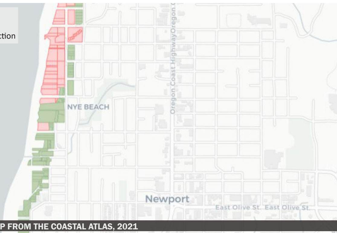
EXAMPLE OF ELIGIBILITY MAP FROM THE COASTAL ATLAS, 2021