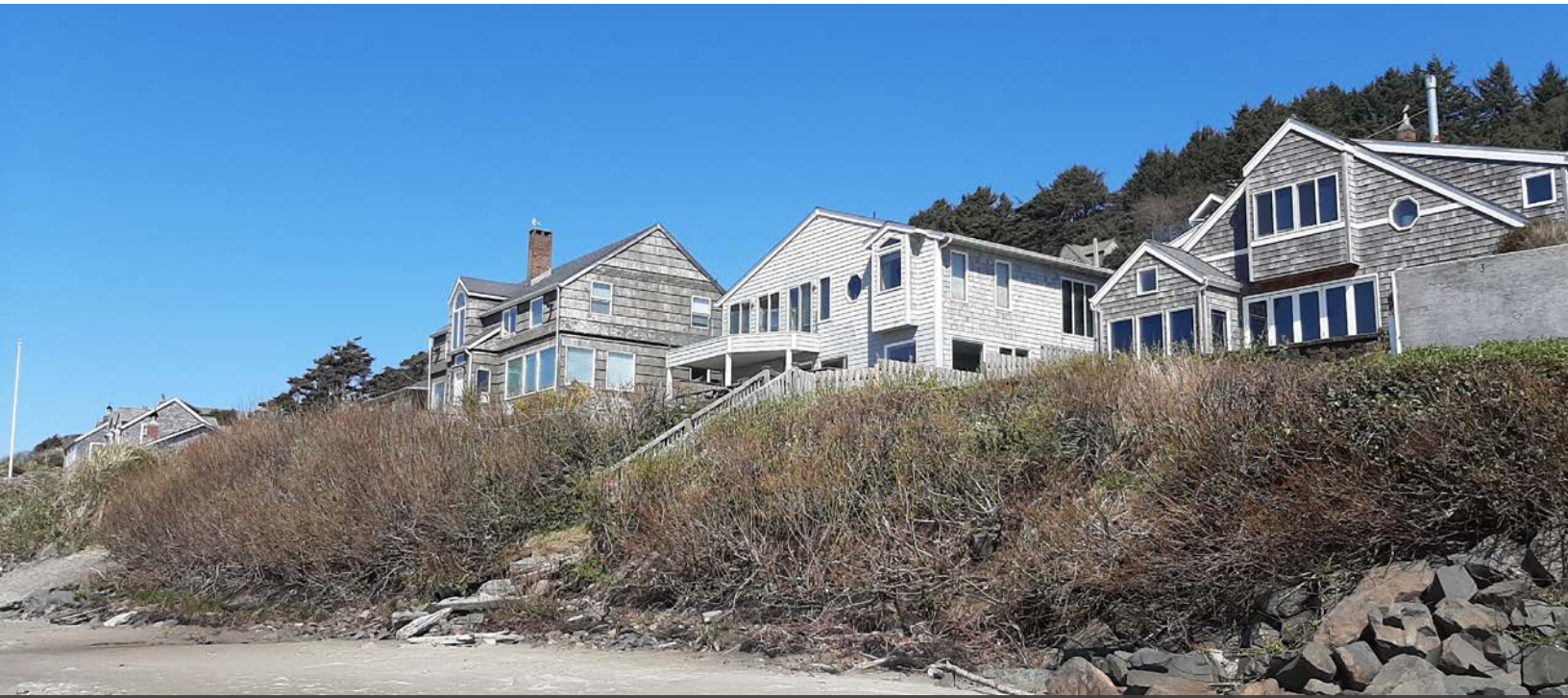
VEGETATIVE STABILIZATION PROJECT IN CANNON BEACH 19 YEARS AFTER CONSTRUCTION.