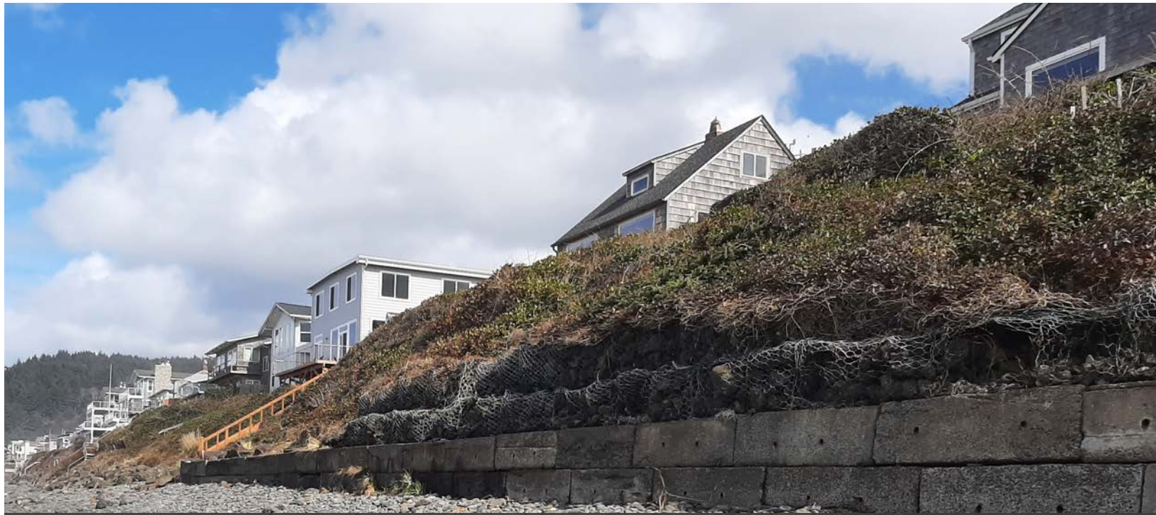
GABION BASKETS AT WECOMA BEACH, LINCOLN COUNTY.

failed gabions are replaced by more substantial hard structures or covered in concrete.” The study suggests due to the regular replacement of gabions with a more substantial structure sooner than expected, gabions may not be as cost-effective as they seem (Jackson, Bush, & Neal, 2006). Gabion structures are classified by the USACE as having high reflection potential, indicating that they are similar to riprap and seawalls in their impact on the beach (USACE, 2011).