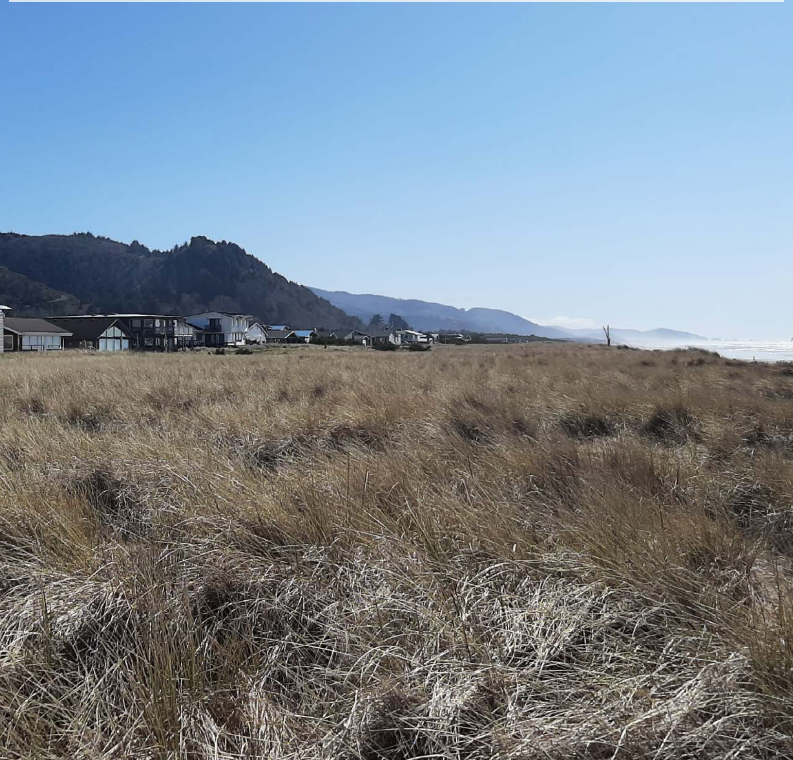
DUNES AT NEDONNA BEACH. PHOTO BY HAILEY BOND, 2021