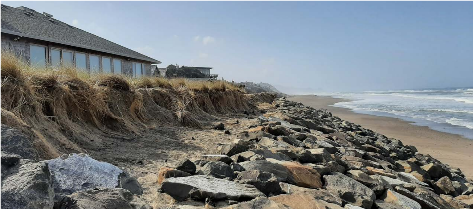
RIPRAP ON THE SALISHAN SPIT.

While riprap is generally successful as a short-term solution for erosion control, it has disadvantages. Riprap protects well against erosion, but in high wave conditions, wave overtopping and flooding can still impact structures behind the riprap. Riprap is susceptible to undermining due to scour, which can destabilize the whole structure and cause its failure. Riprap also has a negative effect on the beach. It takes up more space on the beach than other kinds of structural beachfront protective structures because it needs to be constructed at a 1.5 – 2 horizontal : 1 vertical slope. When placed on an eroding coast, riprap fixes the shoreline in place. However, sand continues eroding from in front of the structure causing beach lowering. This process is known as passive erosion. Under chronic erosive conditions, the beach may significantly narrow and create an artificial headland around the riprapped area. In some cases, riprap can increase the rate of erosion above the background rate. The impact of this process, called active erosion, is difficult to determine in Oregon, where variations in erosion rate can also be caused by powerful rip embayments. However, in general, active erosion is more likely to occur when the mean water level is above the base of the structure (Weggel, 1988; Ruggiero & McDougal, 2001).