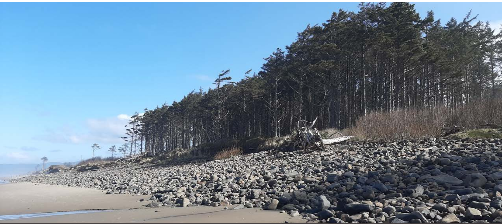
DYNAMIC REVETMENT AT CAPE LOOKOUT. PHOTO BY HAILEY BOND, 2021

for several reasons. First, because the revetment moves and reshapes itself in response to wave conditions, the initial placement of the cobbles is less important than in the construction of a traditional revetment, making construction costs cheaper. Second, because the stone size is smaller, it is typically less expensive than typical armor stone. In Oregon, cobble beaches exist naturally, so constructed dynamic revetments are more compatible with the natural environment than other erosion control options (Allan, Geitgey, & Hart, 2005).