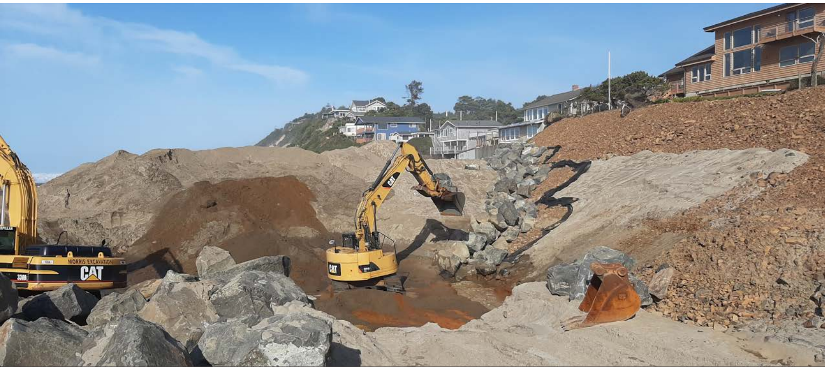
RIPRAP CONSTRUCTION IN LINCOLN BEACH.

Riprap revetments are intended to protect the upland, remain in place, and reflect wave energy, so they are considered a beachfront protective structure and require Goal 18 eligibility for construction. Riprap also requires an ocean shore alteration permit from OPRD, as well as any necessary local permits. Check with the local jurisdiction for any local permits needed if the revetment will extend landward of OPRD's jurisdiction.