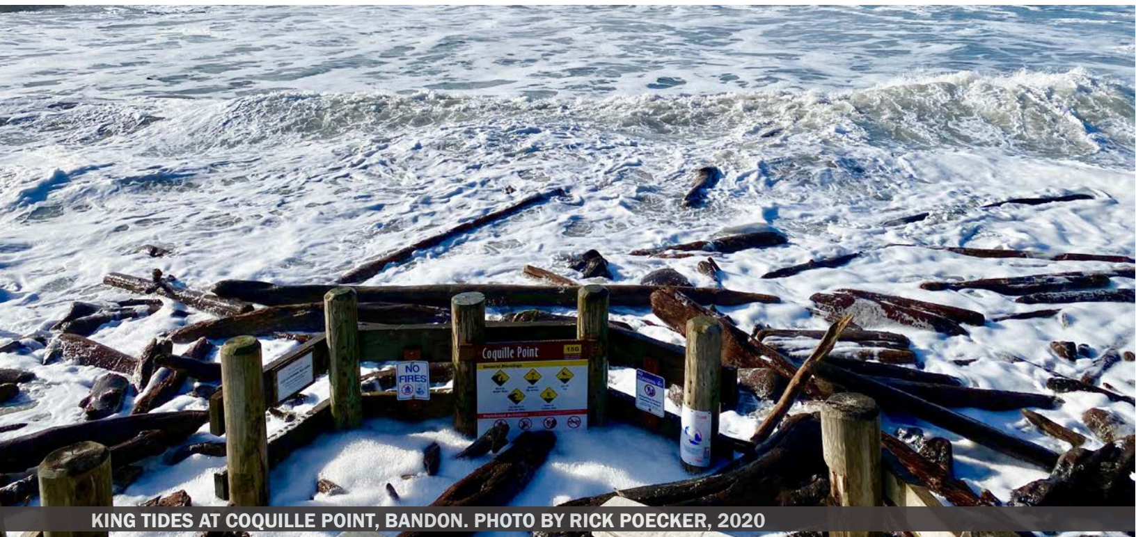
KING TIDES AT COQUILLE POINT, BANDON. PHOTO BY RICK POECKER, 2020

Sea level rise in Oregon is influenced by both its tectonic setting and global-scale changes in the volume of water (US Army Corps of Engineers, 2021). The Oregon coast generally experiences uplift, which means that the land is rising and dampening the effects of sea level rise. Uplift in the central and northern Oregon coasts is currently being outpaced by sea level rise (i.e. sea level appears to be rising), while the south coast and the Columbia River are experiencing higher rates of tectonic uplift relative to sea level rise (i.e. sea level appears to be falling). However, global climate models continue to project increasing rates of sea level rise for the future that will soon outpace the tectonic uplift across the entire Oregon coast (Allan, Gabel, & O'Brien, 2018; Erosion Continues Damage on Oregon Coast - Homes Threatened, More Finds, 2021).