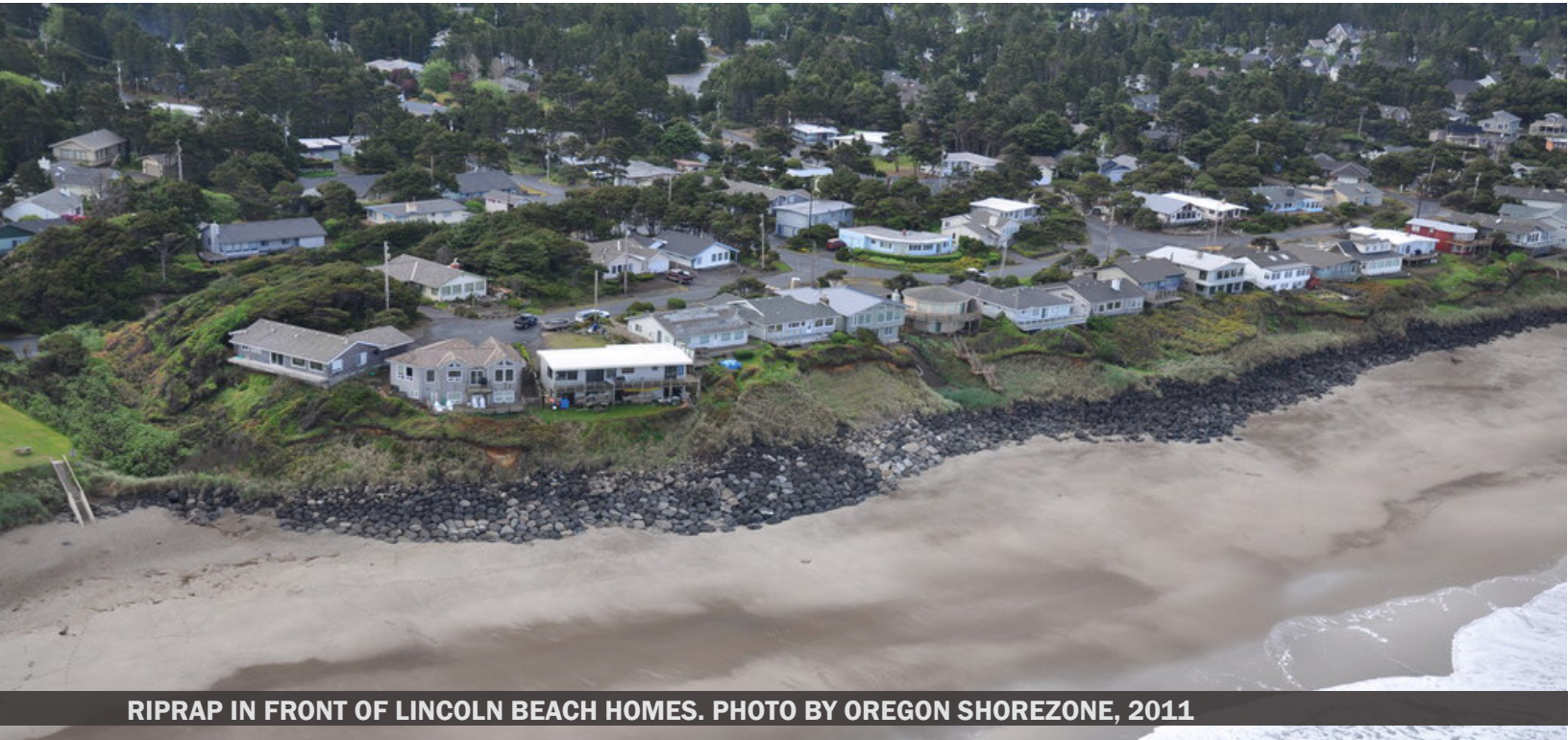
RIPRAP IN FRONT OF LINCOLN BEACH HOMES. PHOTO BY OREGON SHOREZONE, 2011