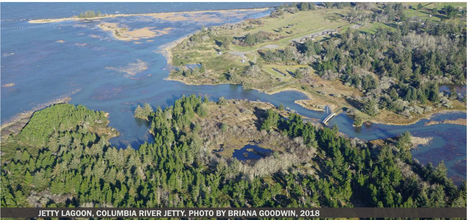
JETTY LAGOON, COLUMBIA RIVER JETTY. PHOTO BY BRIANA GOODWIN, 2018

This document provides some information about the permitting of beachfront protective structures on the boundaries between estuaries and the ocean shore, which may be affected by Goal 16. However, this document is not a guide for Goal 16.