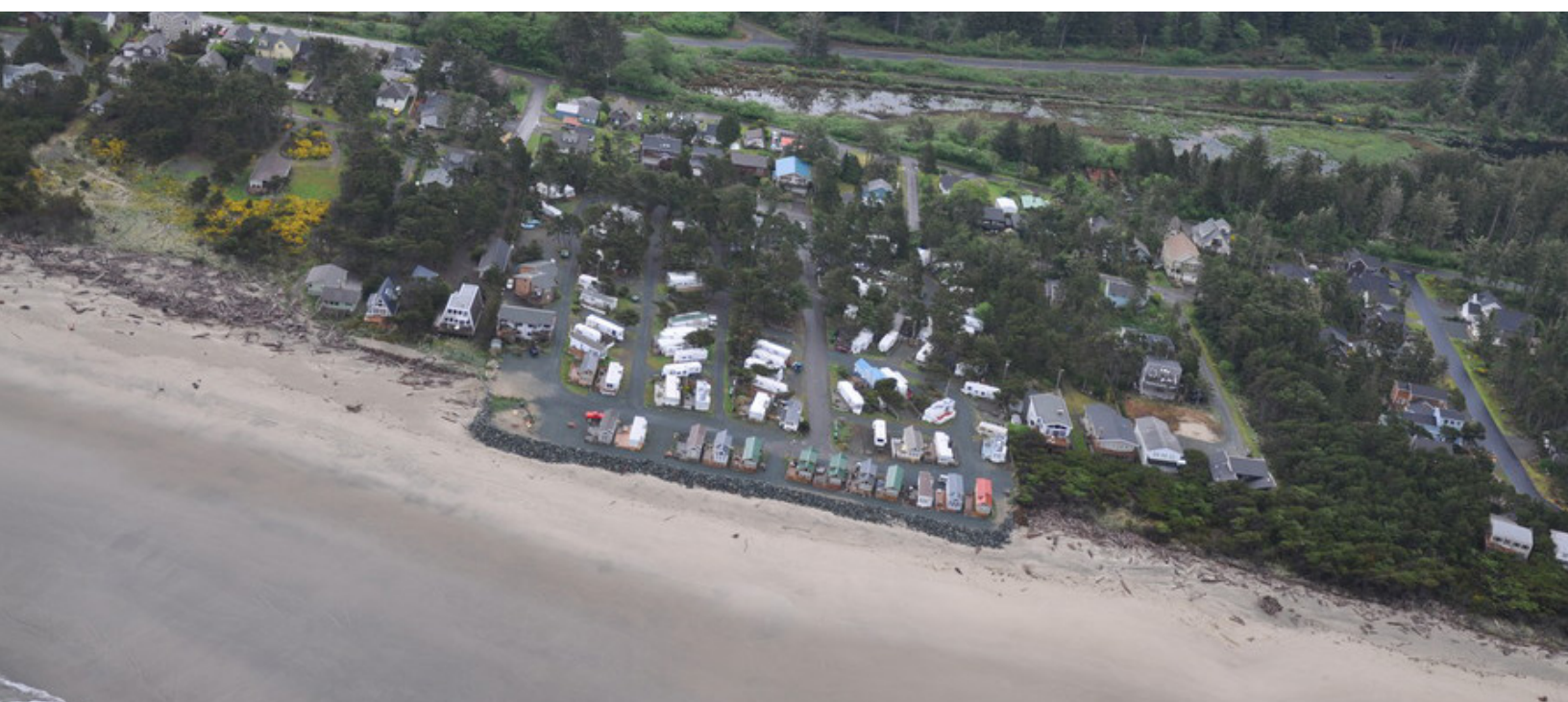
BEACH NARROWING AT ROCKAWAY BEACH.

A littoral cell is a coastal compartment that contains a complete cycle of sedimentation including sources, transport paths, and sinks. In Oregon, sediment sources typically include rivers and coastal erosion, while sediment sinks typically include estuaries and offshore areas. Hardly any sand travels between littoral cells. Using littoral cells to describe the coast is useful because they reflect the physical processes that impact the coast better than jurisdictional boundaries like county or city limits.