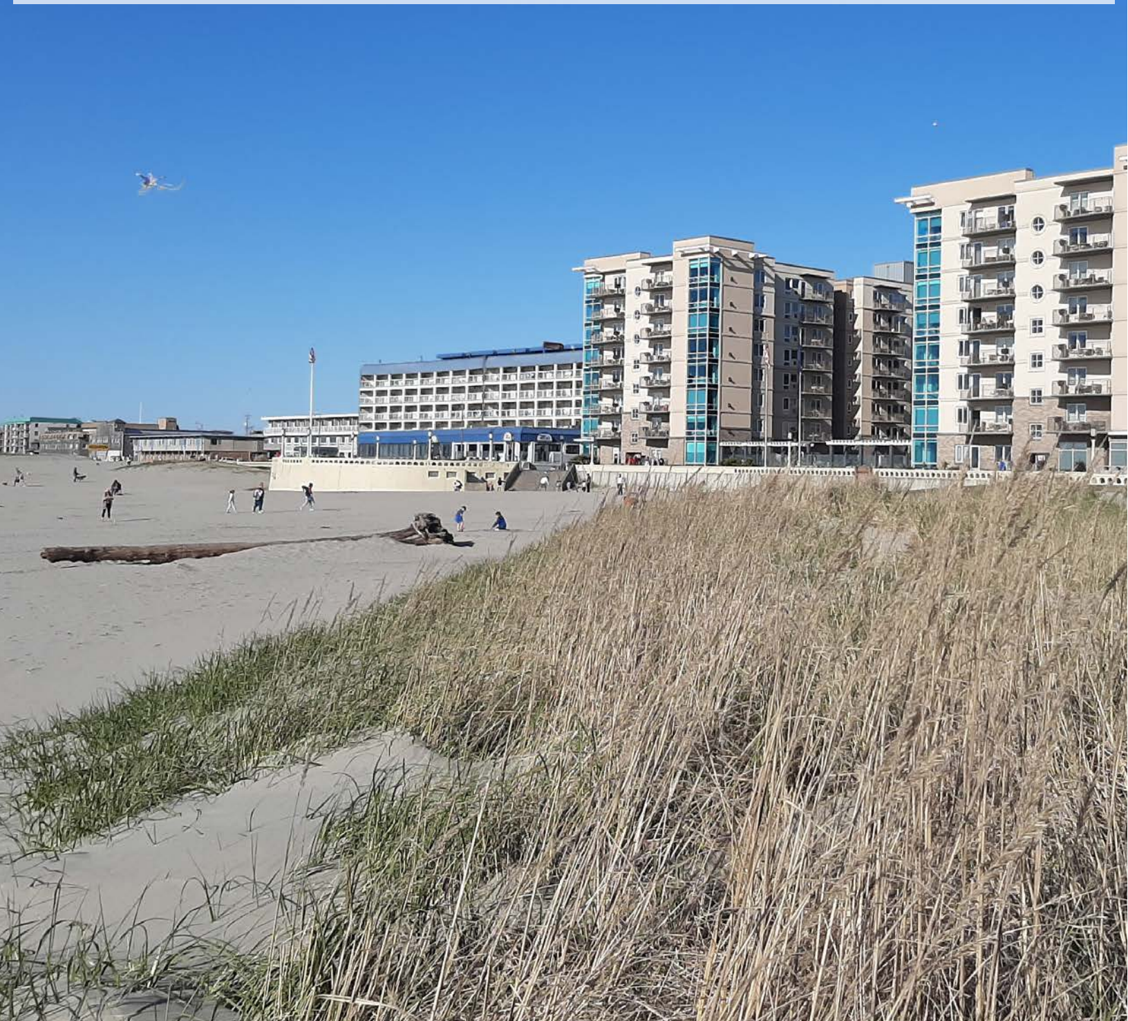
SEASIDE PROMENADE. PHOTO BY HAILEY BOND, 2021