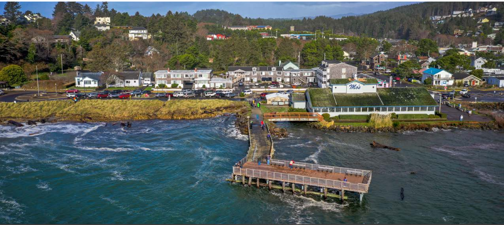
TAFT DISTRICT, LINCOLN CITY. PHOTO BY JOHN COLLINS, 2020

Goal 17 requirements are implemented primarily through local comprehensive plans and zoning. Goal 17's Implementation Requirement 5 is particularly relevant to the permitting of erosion control mechanisms. It states that "land-use management practices and non-structural solutions to problems of erosion and flooding shall be preferred to structural solutions." This implementation requirement has led local governments and permitting agencies to create requirements for alternatives analyses, ensuring that structural erosion control is only used if necessary for the success of the project (Oregon Coastal Management Program, n.d.).