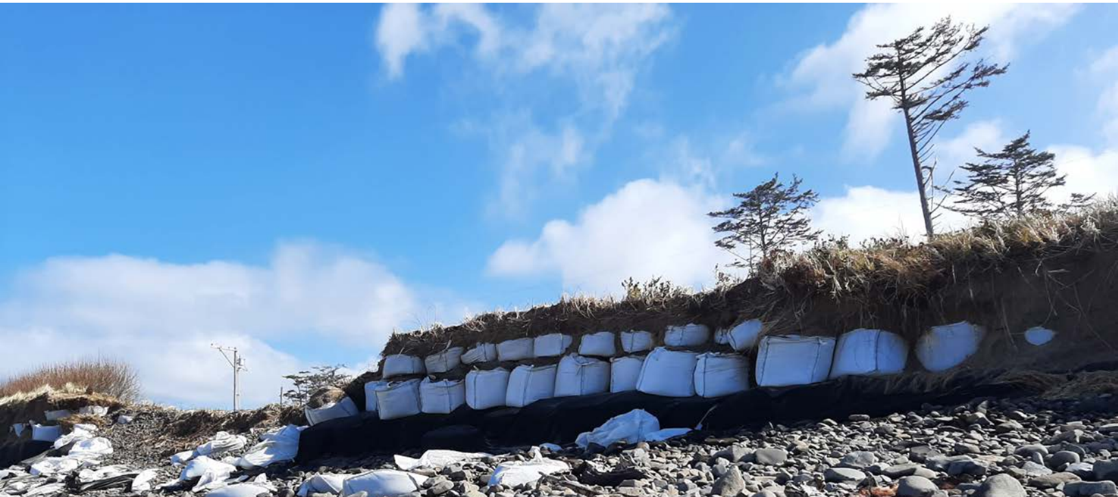
SANDBAGS ERODING FROM ARTIFICIAL DUNE, CAPE LOOKOUT. PHOTO BY HAILEY BOND, 2021

Sandbag revetments have advantages over traditional revetments for a few reasons. Depending on the scale of the project, they can often be placed without costly equipment or skilled labor. The geotextile bags are lower cost than transporting revetment rock, especially in situations where there are no suitable rock sources nearby. Sandbag revetments are also good for temporary protection during episodic erosion events where permanent riprap is unnecessary (RISC-KIT, n.d.).