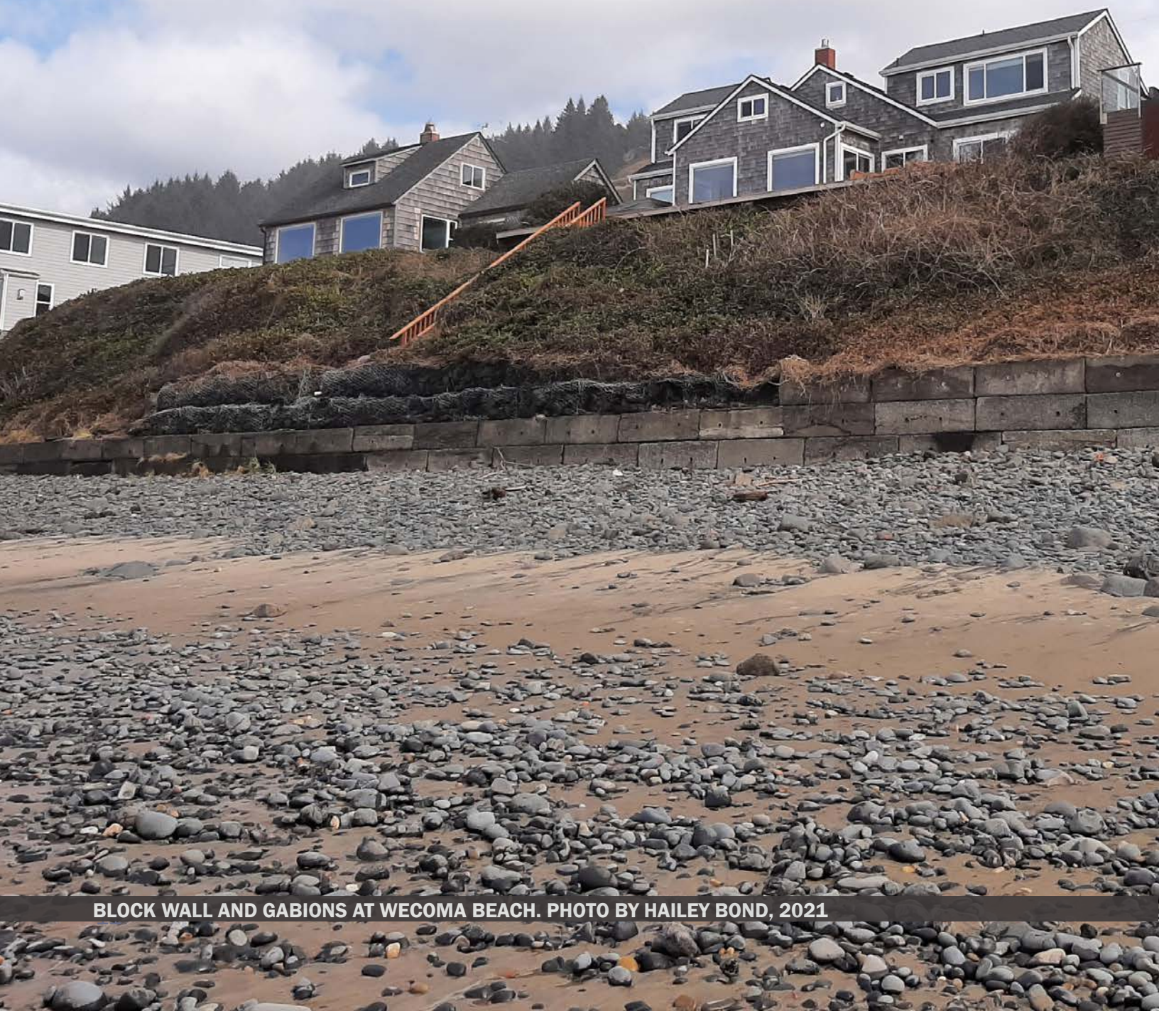
BLOCK WALL AND GABIONS AT WECOMA BEACH.