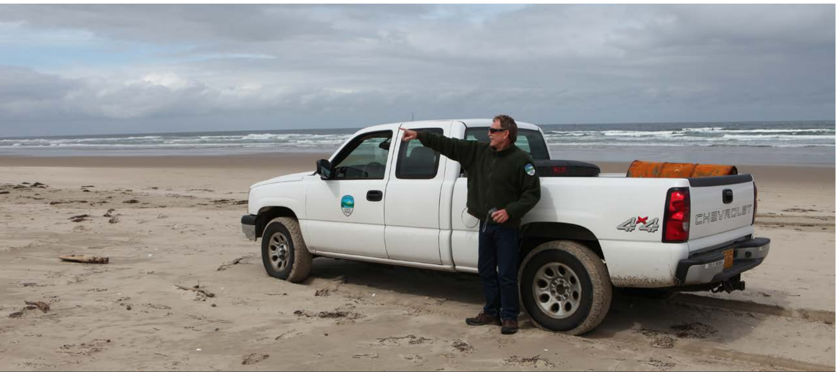
OPRD AT CAPE LOOKOUT, 2011.

OPRD has jurisdiction over the “Ocean Shore State Recreation Area,” which is the area between extreme low tide and either the statutory vegetation line ( ORS 390.770 ) or current vegetation line, whichever is further inland. OPRD may issue ocean shore alteration permits for shoreline armoring projects, access ways, sand alterations, pipelines, cables, conduits, and natural product removal. They do pre-project consultation and pre-project site visits to educate applicants on permitting processes and requirements. OPRD has authority to issue emergency permits. OPRD evaluates permits using general standards, scenic standards, recreation use standards, safety standards, and natural and cultural resource standards (OAR 736-020). While OPRD cannot regulate structures or other shoreline alterations that are landward of the most inland vegetation line, if the alterations are eventually exposed on the beach, they are considered by OPRD to be unpermitted structures and require a new permit. If structures are not in compliance with OPRD regulations, the agency can levy fines of up to $10,000 per day until offending structures are removed or brought into compliance, and/or the shoreline is restored.