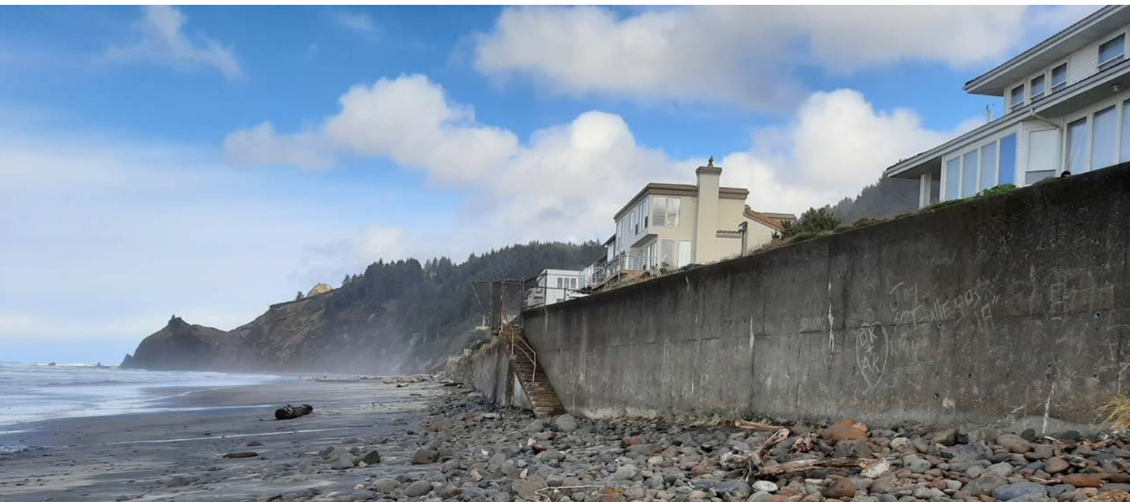
SEAWALL IN WECOMA BEACH, LINCOLN COUNTY.

Seawalls also have an impact on the appearance and recreational opportunities of the beach. Seawalls disrupt the connection between the upland and the beach and require beachgoers to use designated beach access points. They also are not visually appealing and not generally appreciated by beachgoers.