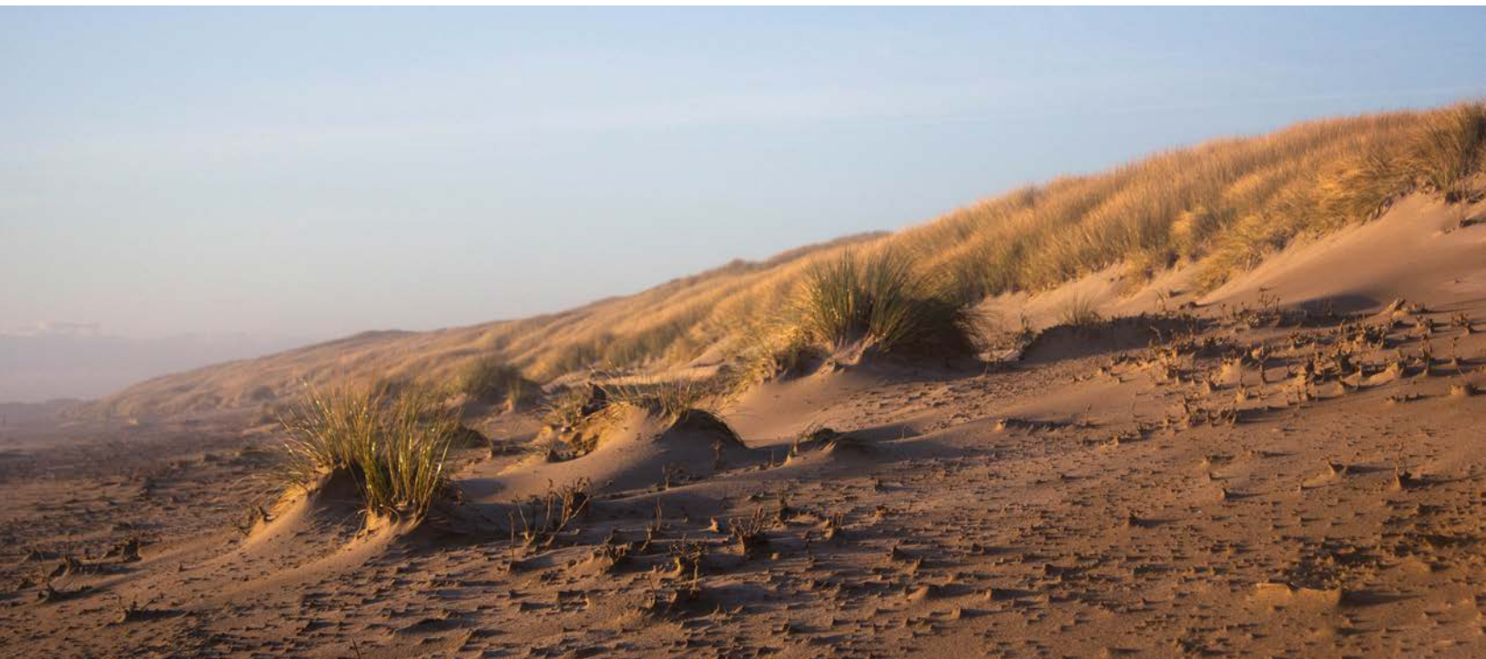
DUNES AT THE NEWPORT SOUTH JETTY. PHOTO BY HAILEY BOND, 2020

Shoreline armoring can cause scouring and lowering of the beach profile, which can result over time in the loss of access to and use of Oregon's public beaches. New development is not eligible for structural shoreline protection and must account for shoreline erosion through non-structural approaches (e.g. increased setbacks). In the face of increased ocean erosion occurring in conjunction with climate change and sea level rise, limiting hard structures and allowing natural shoreline migration is a critical policy tool for conserving and maintaining Oregon's ocean beaches (Oregon Coastal Management Program, n.d.).