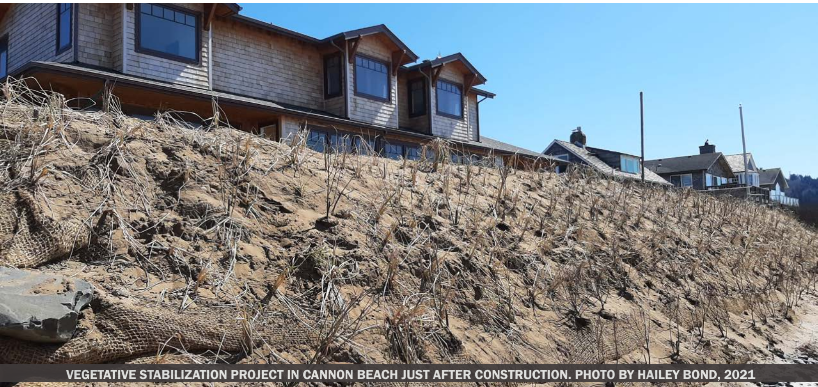
VEGETATIVE STABILIZATION PROJECT IN CANNON BEACH JUST AFTER CONSTRUCTION.

While vegetative stabilization is a valuable alternative to the more common kinds of structural erosion control in Oregon, it is not suitable for every location. This design is not as sturdy as riprap, and therefore cannot protect against erosion in the same way. It is therefore only suited to areas with mild to moderate erosion. The project requires the successful establishment of willow plantings, so it can be affected by poor soil or unusual weather events. The terraced soil burritos are also vulnerable to erosion at the toe of the slope. Several collections of case studies of this type design have identified toe erosion as a common form of failure (Miller, 1998; Alaska Department of Transportation, 2003). Like riprap, the slope is only stable between 1.5 – 2 horizontal :1 vertical, and therefore takes up space on the beach.