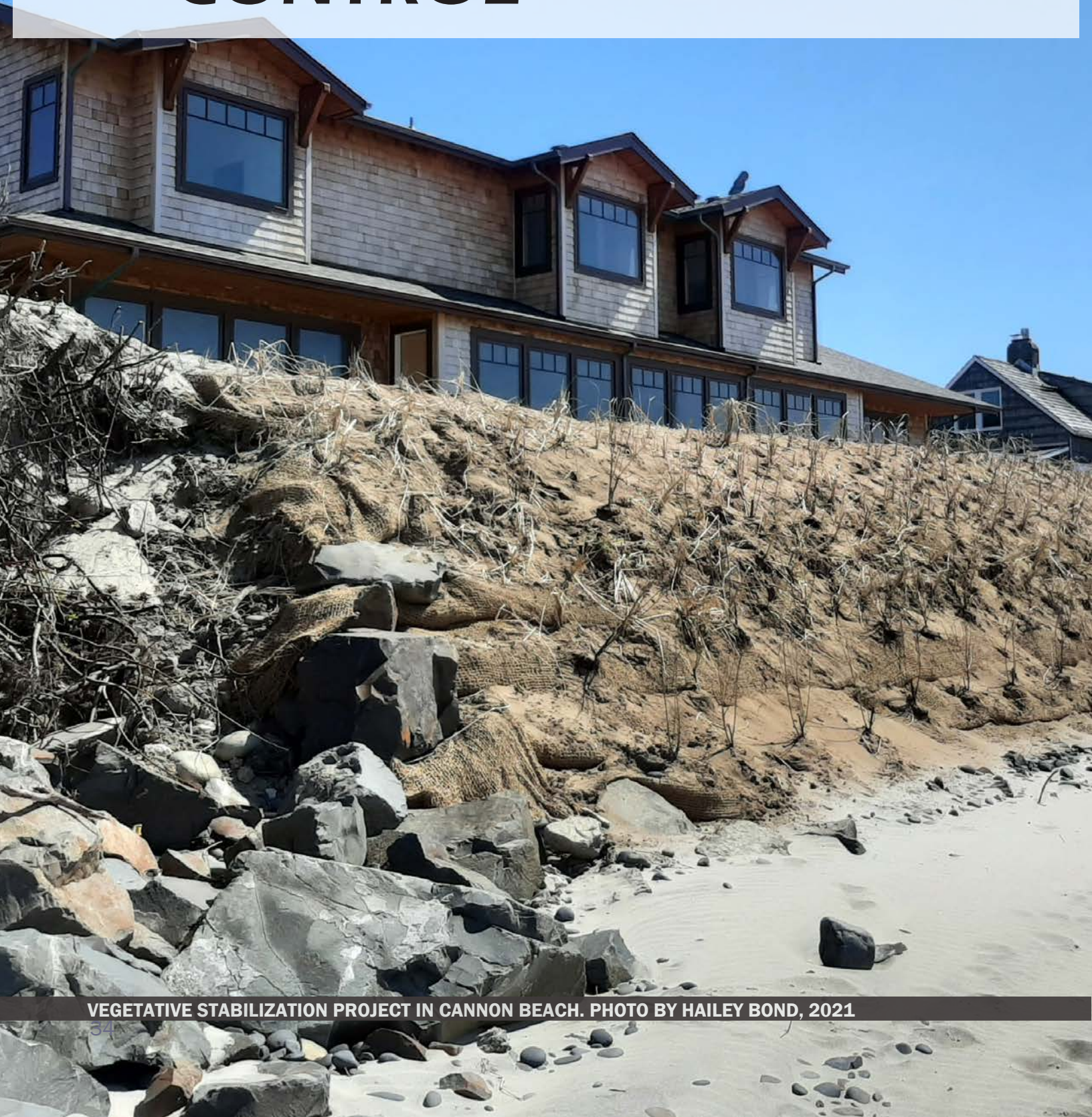
VEGETATIVE STABILIZATION PROJECT IN CANNON BEACH. PHOTO BY HAILEY BOND, 2021