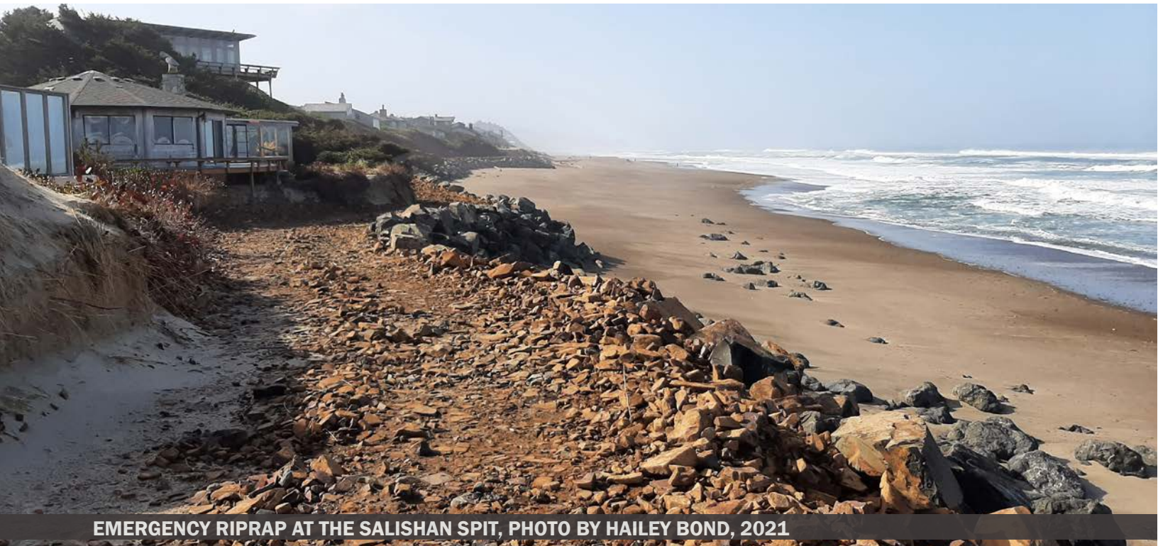
EMERGENCY RIPRAP AT THE SALISHAN SPIT, PHOTO BY HAILEY BOND, 2021

This document will use the above definition of a beachfront protective structure to provide guidance on which erosion control methods typically used in Oregon are considered to be beachfront protective structures and why.