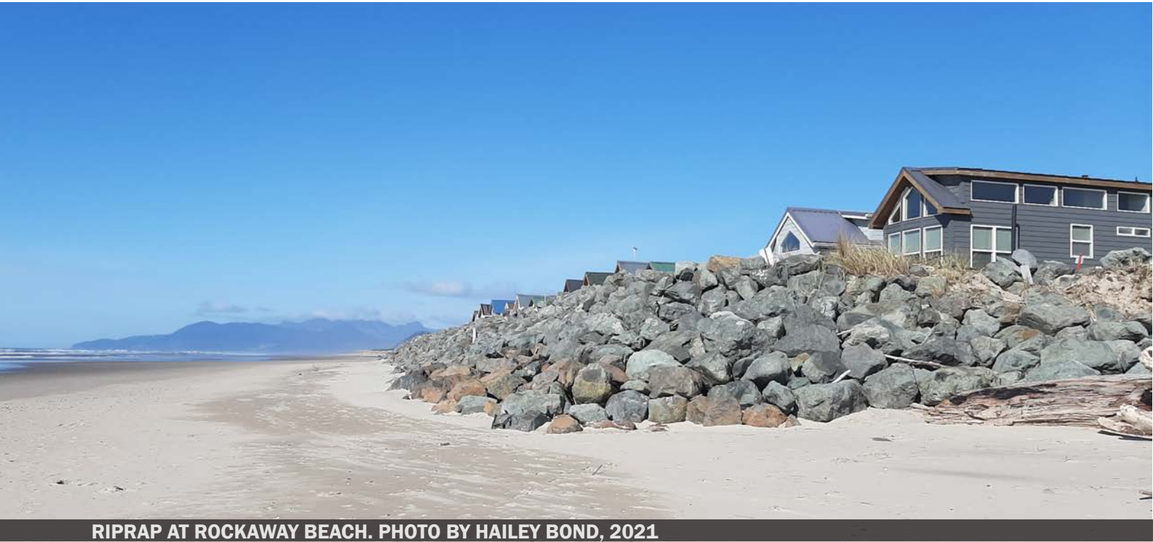
RIPRAP AT ROCKAWAY BEACH. PHOTO BY HAILEY BOND, 2021

Rip embayments occur when rip currents focus wave energy onto a short stretch of coast, causing acute erosion during storms. On the Oregon coast, rip embayments are typically 5-10 lots wide. Rip embayments often form prior to the storm that causes erosion (Komar & McDougal 1988).