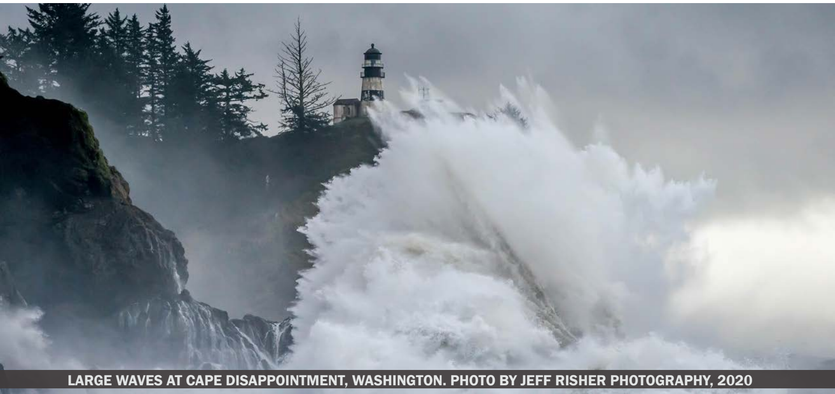
LARGE WAVES AT CAPE DISAPPOINTMENT, WASHINGTON.

Wave heights are not the only drivers of erosion on the Oregon coast; water levels also play a significant role. Oregon has an average tidal range of 5 - 6 ft, but during extreme spring tides, the tidal range can be 10 - 12 ft. In addition to tides, coastal water levels can also be affected by factors such as storm surge, wind, and river discharge (Allan, et al., 2015).