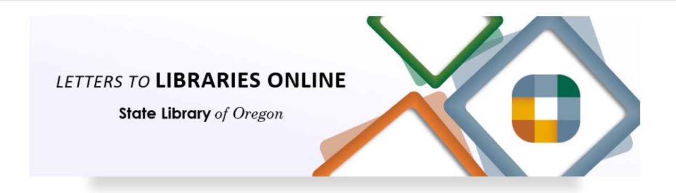
Volume 31 , Issue 3 - March 2021