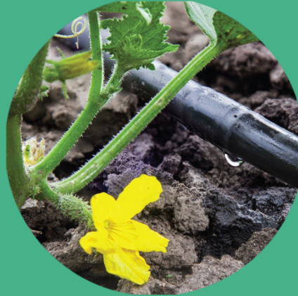
Natural Resources Programs