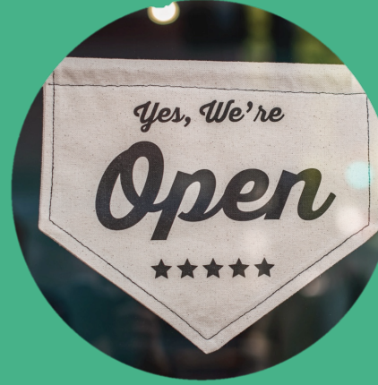
Market Access & Certification