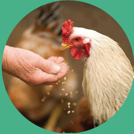
Food Safety & Animal Health