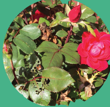
Plant Protection & Conservation