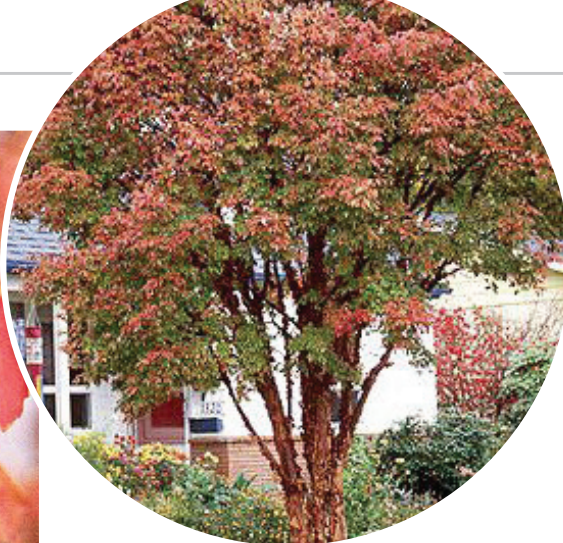
The three-lobed leaves of paperbark maples turn a vibrant red in the fall and sometimes hang on the tree well into winter.