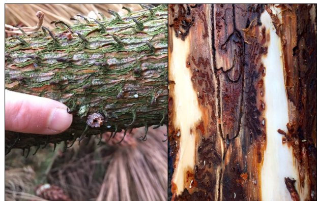
Christine Buhl, ODF

Ips beetles are associated with a variety of other beetles that also infest pine. Ips beetles attack the top of a tree, western (ponderosa only) and mountain pine beetles attack the main bole, and red turpentine beetles colonize