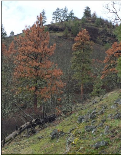
Progression of topkill to whole crown fading and dieback.