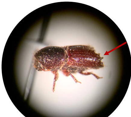
Christine Buhl, ODF

Ips beetle adults are 3-5mm long and have distinct spines (red arrow) along the posterior.