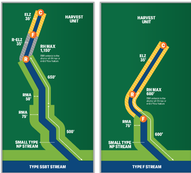
These diagrams are examples only and are not to scale. Conditions and requirements may differ.