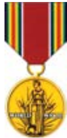
WORLD WAR II VICTORY