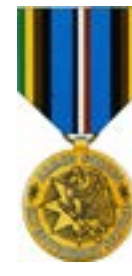
ARMED FORCES EXPEDITIONARY