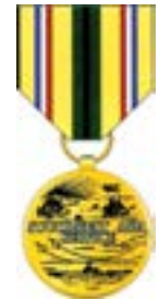
SOUTHWEST ASIA SERVICE