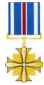
DISTINGUISHED FLYING CROSS