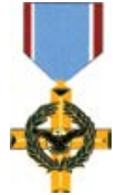
AIR FORCE CROSS