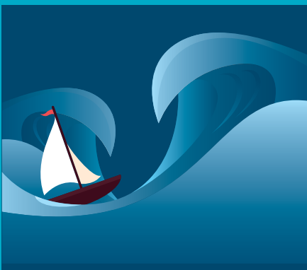
When their storm