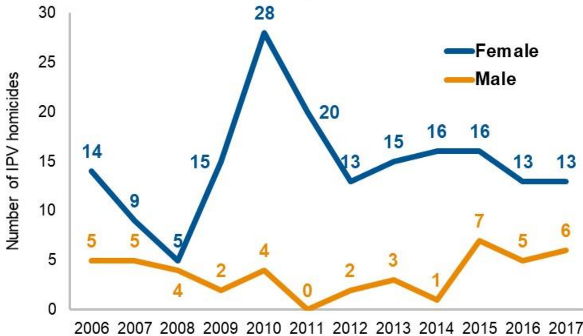
Homicide victims killed by an intimate partner by year and sex of victim, Oregon

Source: Oregon Violent Death Reporting System