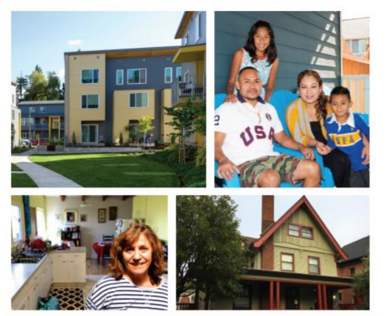
Breaking New Ground OREGON'S STATEWIDE HOUSING PLAN