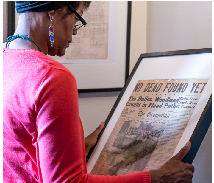
Photo: Vanport Mosaic event focused on memory activism