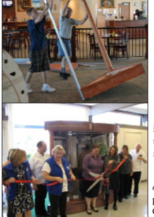
Top: Pedaling History installation at Rogue Valley International Airport, Medford. Bottom: Icons of Agriculture Ribbon Cutting at PremierWest Bank, Central Point.