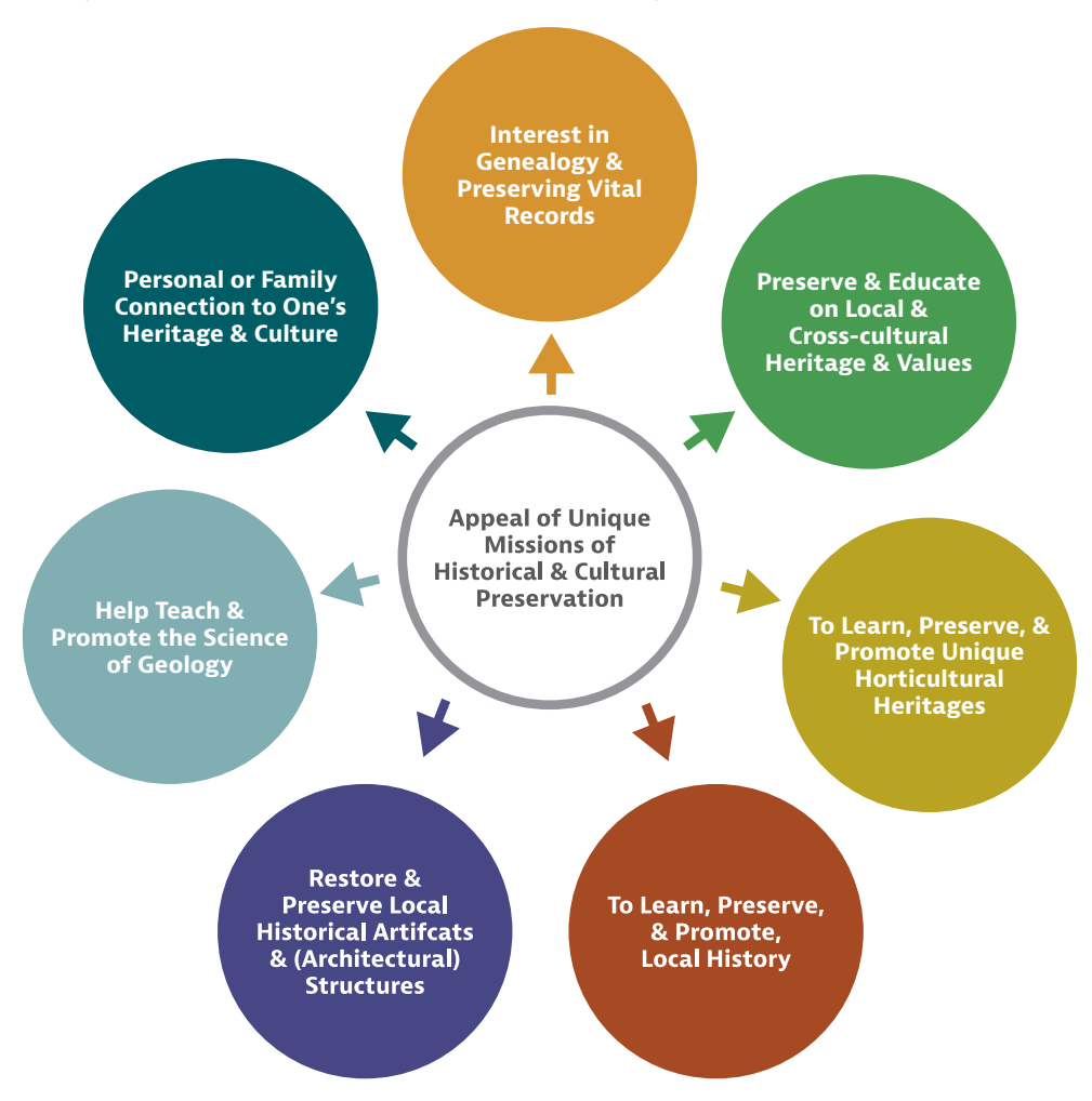
Figure 1 — What pulls volunteers to volunteer their time (& money) to heritage organizations?

Figure 1 below shows the main pull factors to heritage organizations' volunteerism, ranging from interest in genealogy and the preservation of vital records, in promoting unique horticultural heritages, to interest in the preservation of local historical artifacts and architectural structures, and to connecting with one's personal or family heritage.