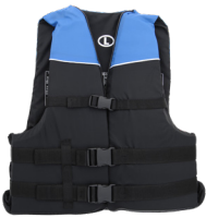
USCG approved & properly fitted life jacket