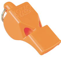
Sound-producing device (one per boat)