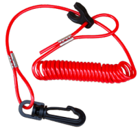
Safety Lanyard attached to operator