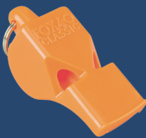
发声装置 (每艘 船一个)