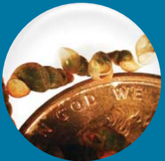
New Zealand mud snails