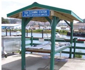
Fish cleaning station

In small quantities, fish waste is scavenged by crabs and other marine animals. However, in an enclosed marina basin decomposition of excessive fish waste can produce foul odors and harm water quality through increased nutrient and bacteria levels and decreased dissolved oxygen. This can cause fish kills as well as an unsightly mess.