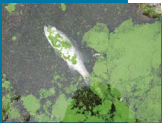
Fish can be killed by the toxins produced by Microcystis algae

Excess nutrients (nitrogen and phosphorus) contribute to toxic algal blooms which can be harmful to people and deadly to wildlife and pets. While most nutrient pollution comes from agricultural runoff and domestic sewage, boaters can help by using phosphate-free soaps and detergents on the boat and at home.