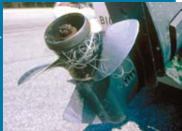
Boat propeller entangled in monofilament fishing line