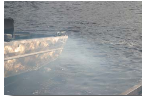
Two-stroke engine exhaust

Inefficient two-stroke engines release up to 30% of their gas/oil mixture unburned directly into the water. For every 10 gallons of gas used, more than two gallons of gas and oil go into the water in the form of a rainbow sheen seen when the motor is idling.