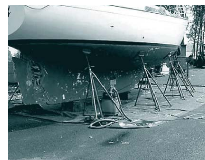
Vessel bottom work

Antifoulant coatings on boat hulls are another toxic threat to marine life. These coatings contain compounds such as copper to kill marine organisms so that they don't grow on the underside of a boat. However, these coatings, especially soft coatings (a.k.a. ablative, self-polishing, or sloughing), release toxic compounds into the water. Hard coatings also have antifouling properties, but limit the amount of toxic metals leached into the water.