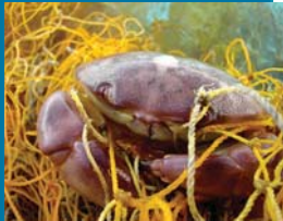
Crab entangled in derelict fishing gear