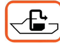
Look for the International Pumpout Sign