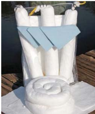
Oil absorbent materials