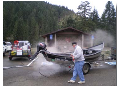
Pressure washing boat after use

your boat between uses if possible. Leave compartments open and sponge out standing water. Find a place that will allow the anchor line to dry.