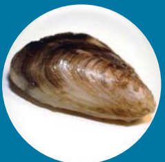
Zebra/ Quagga mussels

ALL EMERGENCIES ..... 911 (Indicate if water related; know your location)