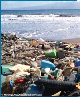
Marine debris on beach