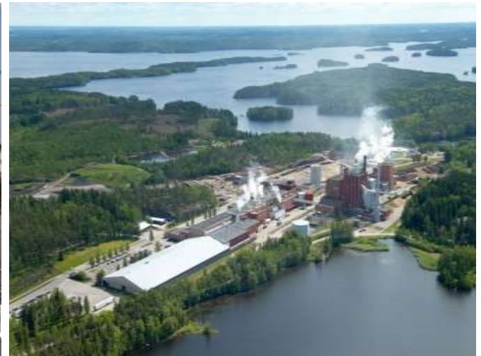
New Source Performance Standards (NSPS) 40 C.F.R. part 60