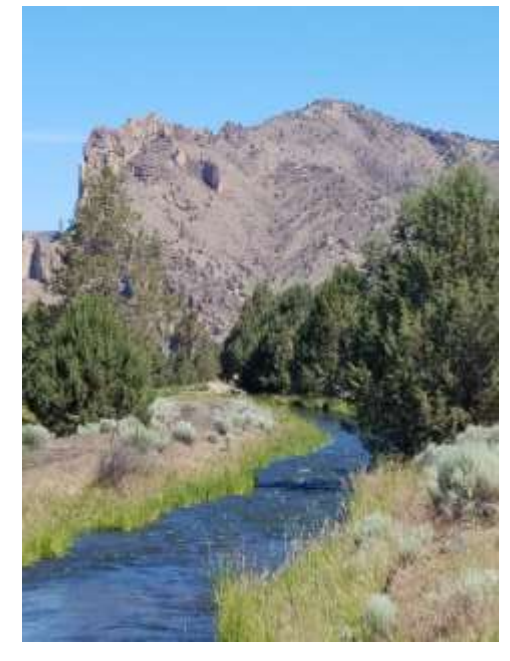
Central Oregon Irrigation District open canal flows by Smith Rock