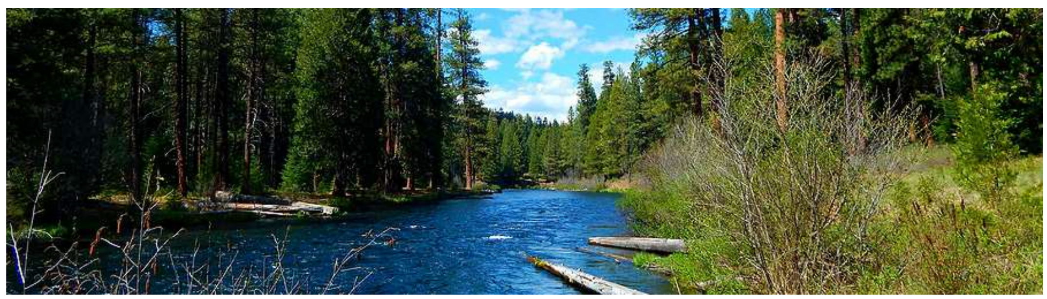
Metolius River, Oregon