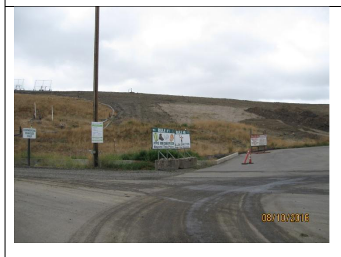
Northwest corner of landfill, where additional cover soil was recently placed.