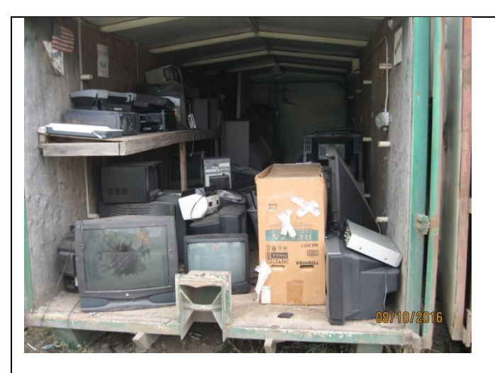
Trailer for recycling electronics.