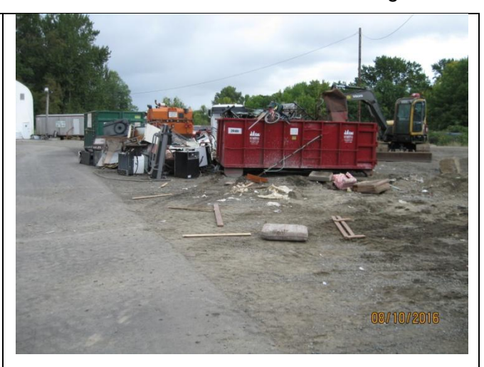
Recycled scrap metal. Site staff noted that recyclers do not always pick up material quickly enough to address the quantity of materials brought to the site. Debris was observed next to this trailer.