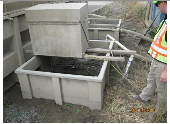
Sediment holding bins for storing sediment from wheel wash water. Waste Management plans to lower these tanks in the next few weeks to provide greater sediment storage volume, to improve the efficiency of the wheel wash.