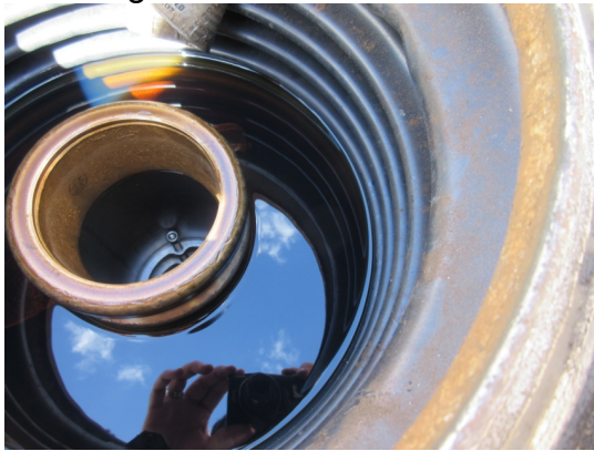
Excess standing liquid