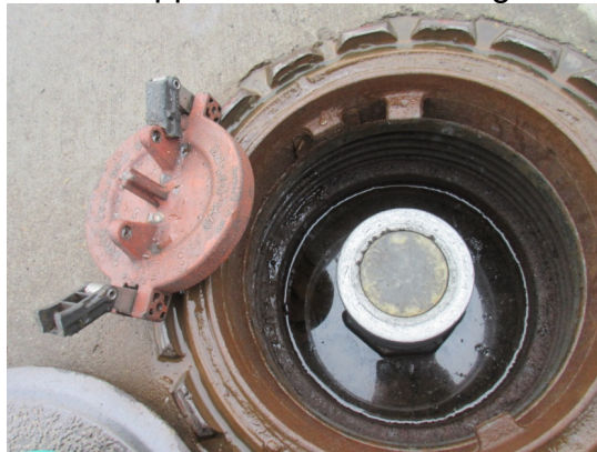
Cap worn or ineffective