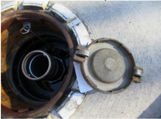
No gasket/seal on fill tube.