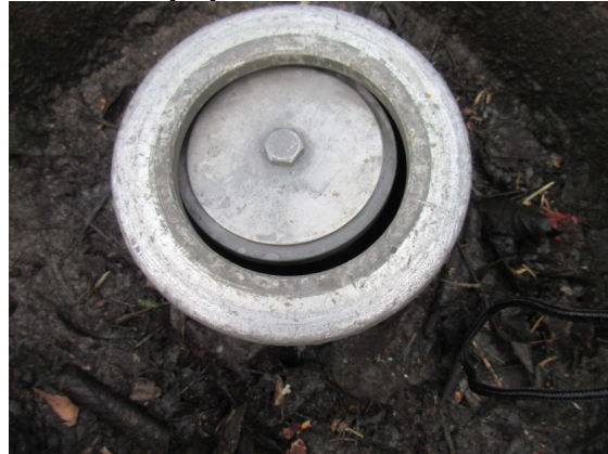
'Poppet Valve' not sealing