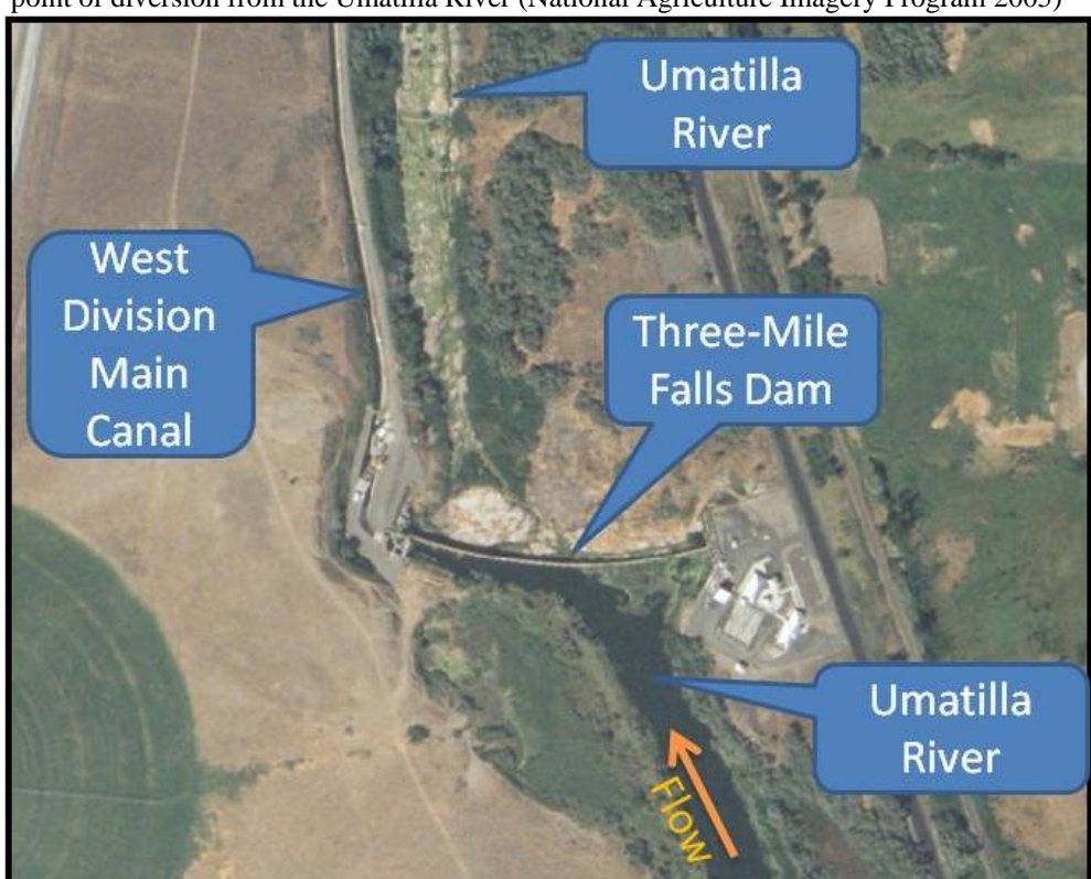
Figure 2. Aerial photograph of Three-Mile Falls Dam and West Division Main Canal point of diversion from the Umatilla River (National Agriculture Imagery Program 2005)<sup>11</sup>