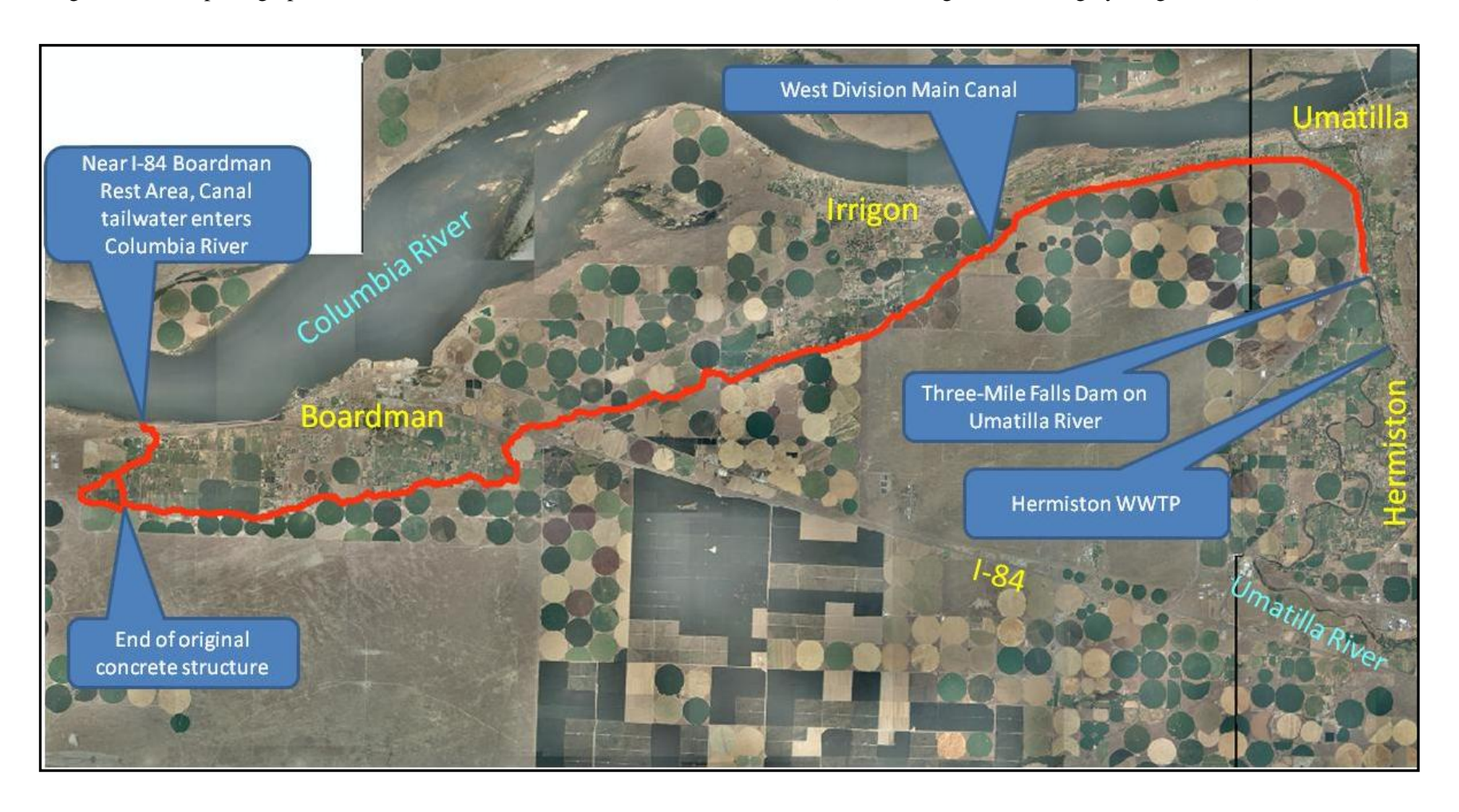
Figure 3. Aerial photograph of West Division Main Canal area, canal shown in red (National Agriculture Imagery Program 2005)<sup>12</sup>