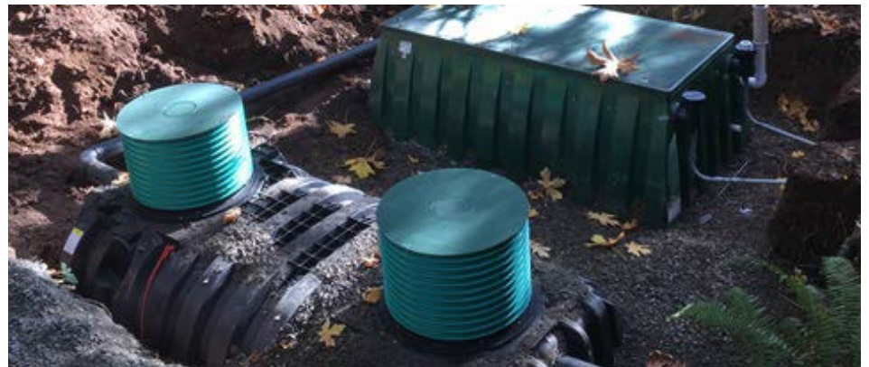
New septic systems can prevent environmental damage and health risks associated with leaking systems.

* Additional reviews can be scheduled if five or more applications are received