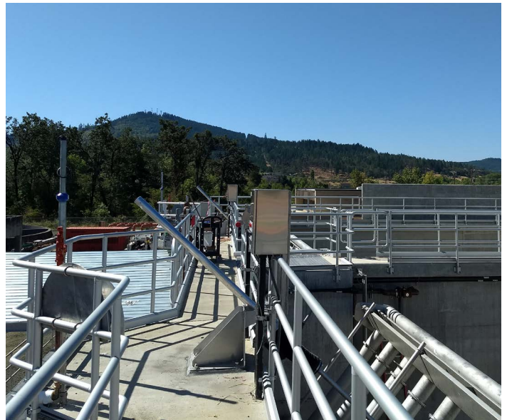
A walkway in the new facility, looking south.

The new facility features a 2.0-MGD (AWWF) activated-sludge treatment plant with UV disinfection, tertiary filtration, full laboratory and modern control system. The existing plant is being modified to chlorinate and to pump plant effluent to multiple users of recycled water. It will also provide aerobic digesters and a screw press for processing sludge. In order to ensure no discharges to Calapooya Creek during the summer months, a 90-acre effluent storage pond was purchased in anticipation of this project.